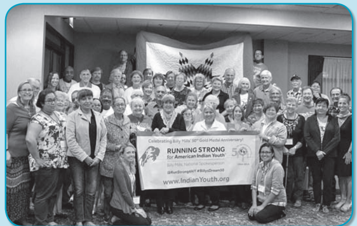
The 2014 tour group!