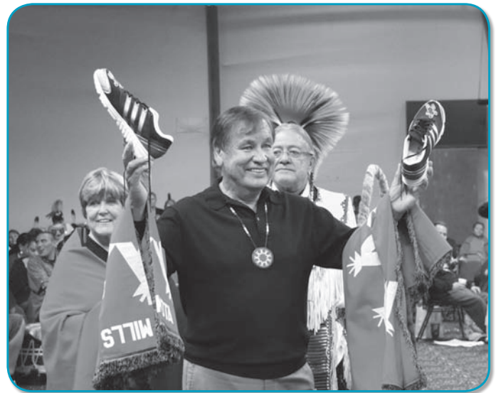
Billy and his wife Pat at the Pine Ridge wacipi (pow wow) celebrating the 50 th anniversary of his gold medal win.

By making a legacy gift you will be helping to ensure that that the work Billy and Running Strong have been able to do for the past 30 years to help Native American youth realize their dreams for a happy, healthy and successful life will continue for the next 30, and far beyond.