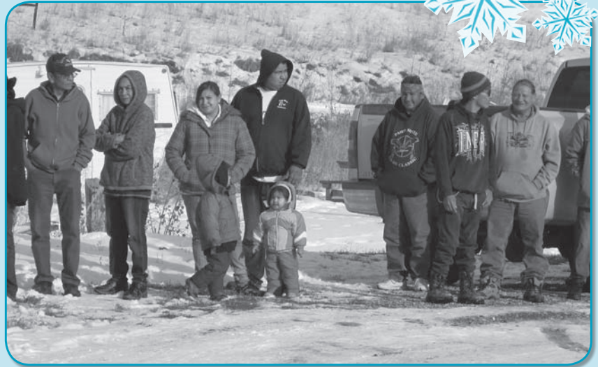
Pine Ridge residents lined up waiting to make their contribution to the Heat Match Program. ©2015

While it can be difficult for a family on the reservation to come up with the $100 to take full advantage of the match, it's obviously much harder for them to raise $250, the minimum amount the propane company charges to make a delivery without the Running Strong heat match. For those with electric heat, Dave said the matching funds are applied directly to